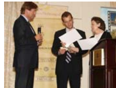
BCR 2 nd Prize