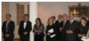
RSA Dinner guests

Carol concert during the reception kindly provided by the Children of the School of Romanian Culture and Tradition in London The event Christmas raffle raised £450 for the School in order to assist it to fund much needed materials, space and people to help run its operations. Thank you to all the guests for their support.