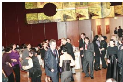
Our guests dancing!